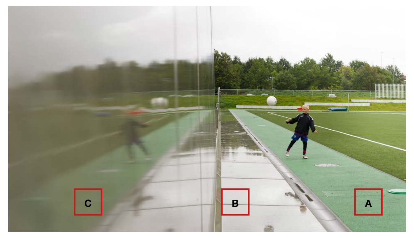
Figure 2. Image of a 3G Artificial Turf pitch with (A) a solid (tarmac) surface surrounding the playing surface, (B) an elevated (concrete) edge with slope angled towards drainage gutter and (C) a ground up barrier (solid wall) surrounding the perimeter.