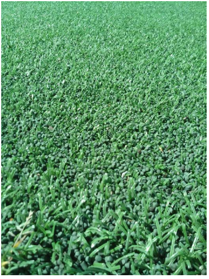
Figure 4. 3G artificial turf with TPE pellets acting as performance infill (Gothenburg, Sweden)