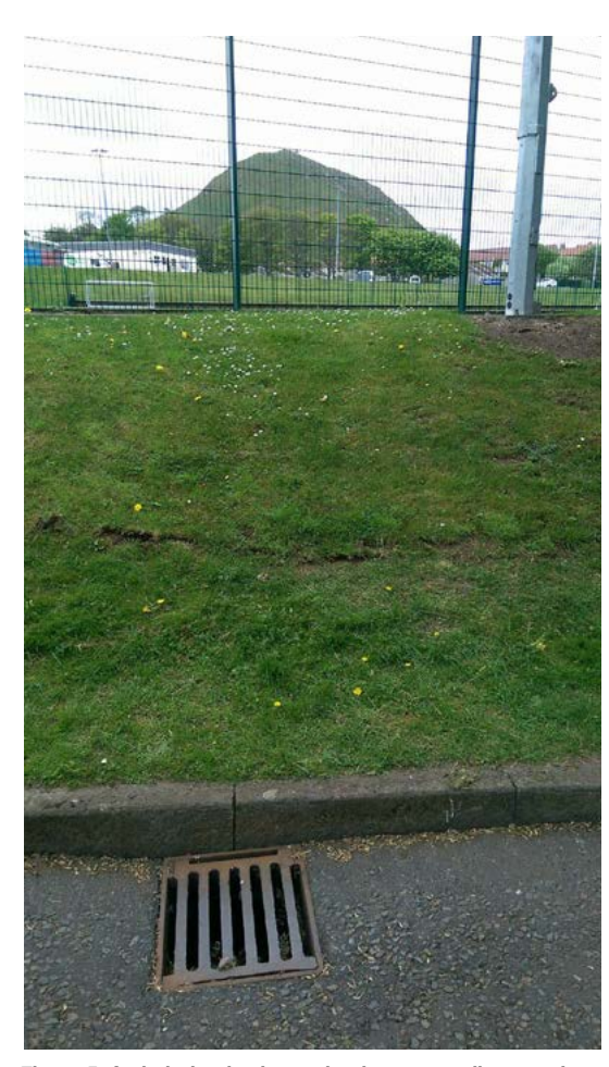
Figure 5. A pitch that is elevated to its surroundings, and close to an open gutter represents a risk of granules escaping directly to storm water