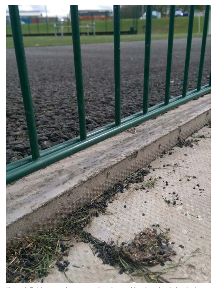
Figure 6. Rubber granules scattered on the outside edge of a pitch - the fence is open at the base allowing granules to escape easily