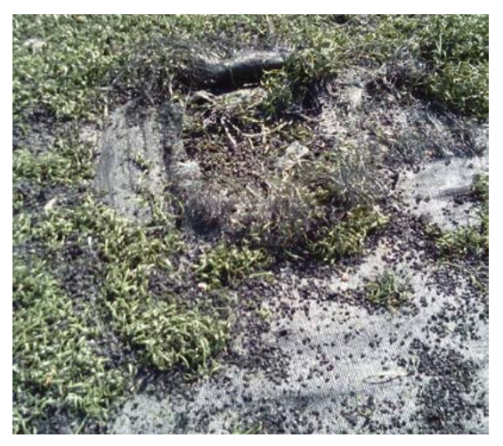
Figure 7. A poor quality pitch where both infill and grass are escaping, and the pitch has become unusable