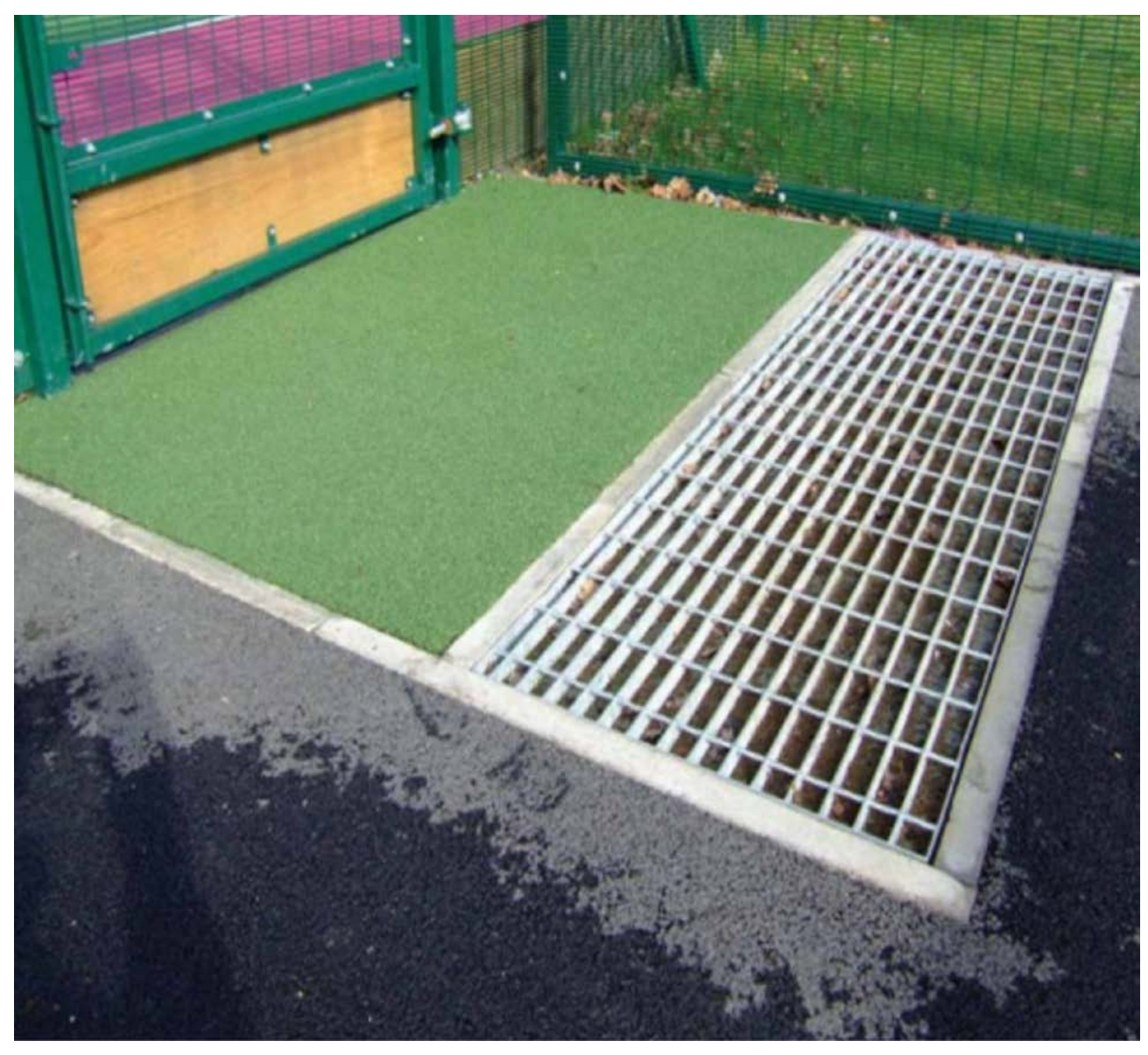
Figure 3. Foot grate - can be used to stamp off