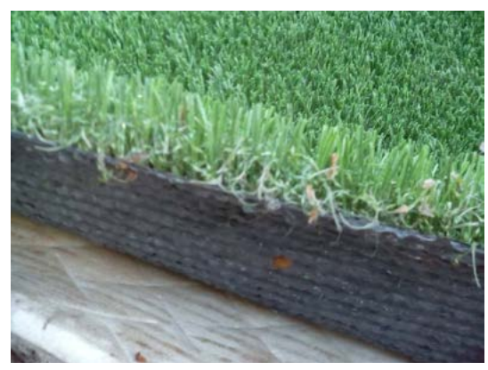
Figure 8. A non-infill design, with underlying shock pad